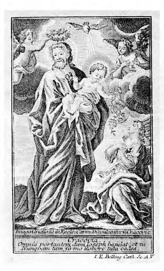
I. E. Belling, Copperplate of the venerated image of St. Joseph, Patron of Krakow from XVIII century.