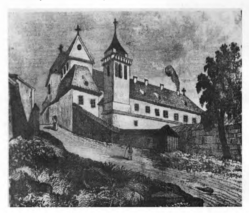
The cloister and the church of St Michael and St. Joseph of the Discalced Carmelites in Krakow. Steel engraving J.W. Linke, XIX century

The early Baroque brick church was built on the plan of a Latin cross, with the façade turned east towards Grodzka Street. The main body had three aisles and a transept. The aisles were reduced to two pairs of side chapels connected with a narrow passageway. The façade of the church had no tower but had two-storeys and three-spans, and was modified according to the style of Il Gesu , in compliance with an accepted model and the regulations of Carmelite architecture<sup>6</sup>.