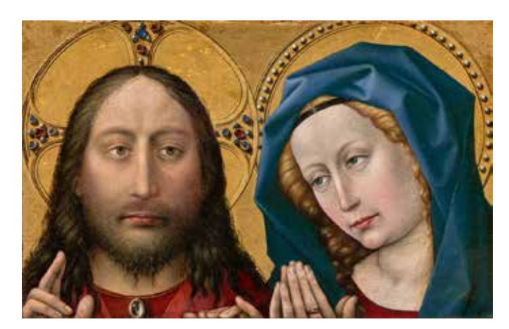
Master of Flémalle, Christ and the Virgin, ca. 1430, Philadelphia Museum of Art

ca. 1430, Philadelphia Museum of Art) [fig. 2].<sup>27</sup> The half-length images of Salvator Mundi were very popular in the second half of the fifteenth century, not only in panel painting, but most of all in illuminated prayer-books. For example, since ca. 1460 Salvator Mundi have replaced the depictions of the Holy Face in the Books of Hours decorated in the so-called Ghent-Bruges artistic