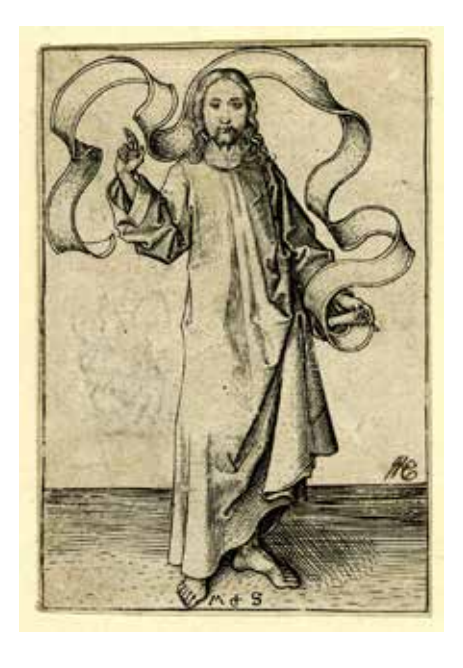
9. Martin Schongauer, Salvator Mundi , print ca. 1468–82, H32

1472.53 Two other remaining medieval canvas paintings from the Central Europe are: Assumpta from the White Mountain (ca. 1450, National Gallery in Prague)54 and the Martyrdom of St Acacius and Ten Thousand Martyrs at Mount Ararat from St Egidius church in Bardějov (first half of the fifteenth century, Šarišské Muzeum in Bardějov).55 Salvator Mundi from Cracow cathedral is the only example of a late-medieval canvas preserved in Lesser Poland. Nevertheless, such objects have been mentioned in the written sources there throughout the whole fifteenth century. 56 Perhaps Salvator Mundi from Cracow Cathedral was painted on canvas because that was the support used for the lost original Netherlandish image that Cracow painter copied. Also, cloth as a support fits well to the depiction of Salvator Mundi as it refers to the tradition of the Holy Face placed on the Veil of Veronica. Or, maybe, the painting from Cracow Cathedral was originally intended to be transported somewhere, so the canvas support seemed more suitable than a panel. That,