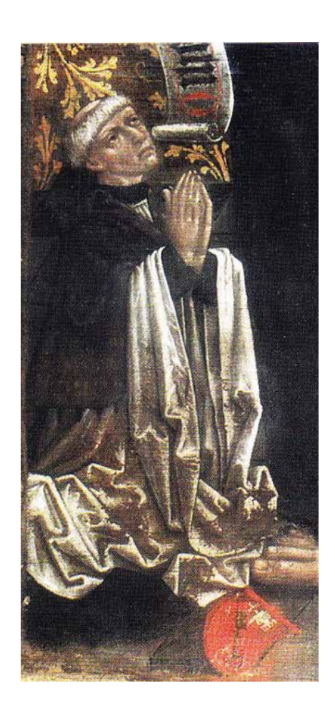
13. Donor — detail of Salvator Mundi from the Cracow Cathedral

Czarny, son of Marcin. <sup>65</sup> Unfortunately, one must be very careful in analysing this Crucifixion , as it was much repainted in the process of renovation in the first half of the twentieth century (although the restoration in the 1990s was supposed to remove the over-painting).