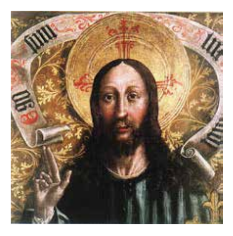
11. Comparison of the details of the the Braque Triptych by Rogier van der Weyden (ca. 1450, Paris, Louvre) and Salvator Mundi from Cracow Cathedral

their corners go down a bit. His eyebrows are straight and his eyes are rather small. The most significant element, though, is the form of the strangely angular folds of his clothes: they are narrow and wrinkled, they seem crushed in a nervous way, and they are actually flat and not dynamic; they don't follow the patterns popularised by Veit Stoss and rooted in the style of Rogier van der Weyden. Actually, these folds of the donor's clothes don't resemble any forms present in various Lesser Poland paintings of the end of the fifteenth century. On the other hand, the latest examinations of the painting confirmed that the donor was an integral part of the original composition.