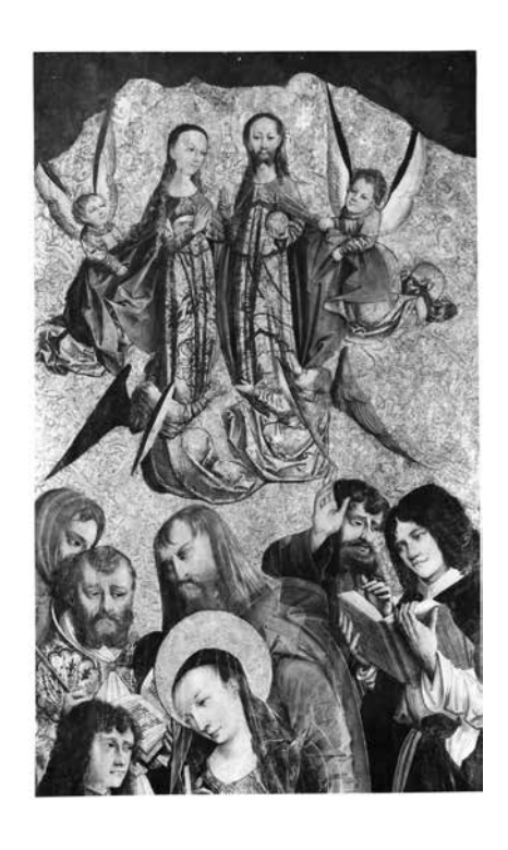
Detail of Dormition and Assumtion of the Virgin Triptych by Marcin Czarny, ca. 1508, parish church in Bodzentyn