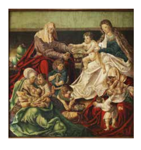
14. The Holy Kinship from Dubravica, ca. 1510 – 20, the Hungarian National Gallery in Budapest