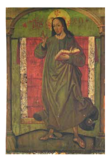
Salvator Mundi, back of the central part of a retable, Rauriser Altar, Salzburg Museum, 1490s

There is another aspect of the painting from Cracow that points to its Netherlandish sources: the fact that the image's support is canvas. It is important to stress that a combination of panel and canvas was used by the late-medieval painters as a support in two ways, which should not be confused. One way was to cover the wooden panel with canvas at the beginning. Such a support was then grounded and gilded, and covered with a thick layer of paint, which resulted in the smooth and shiny surface of the painting, not revealing the canvas' structure. Paintings produced in this way are considered as panel paintings and it seems that this technique was also rather common and popular in Lesser Poland. A very different situation was in the case of the actual canvas paintings: they were often painted with very little or no ground, and characterised with a very thin paint layer,