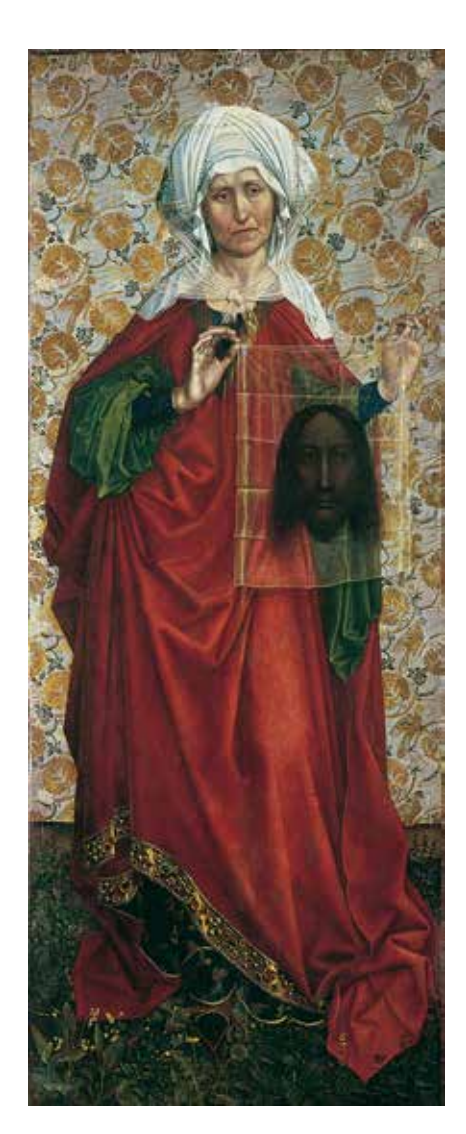
10. Comparison of one of Flémalle panels (St Veronica, ca. 1430, Städelsches Kunstinstitut, Frankfurt am Main) and Salvator Mundi from Cracow

in fact, seems to be the most probable explanation in this case