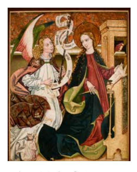
12. Annunciation from Cięcina, ca. 1490 — 1495, National Museum in Cracow

may be traced in the Central European sculptures created after 1500. One of the examples could be the statue of the Virgin with the Child that used to be a part of a retable dated to ca. 1506; the figure is now in the church of Saint Catherine in Banská Štiavnica (Slovakia) [fig. 15].60 Not identical, but a somehow similar approach to the folds may be observed in the Triptych of Jan Olbracht, created in Cracow ca. 1503 (the Cracow Cathedral, The Chapel of Czartoryski).61 Another example could be a figure of the Virgin with the Child in the parish church in Krosno (ca. 1512?). 62 As a result, it seems that in general such dense and crushed folds may rather point to the beginning of the sixteenth century. Sadly, it is difficult to find other similar examples in the Cracow painting. The closest forms would be represented, but only in certain details, in some paintings created in the first decade of the sixteenth century, in the circle of a Cracow painter Marcin Czarny, who died in 1509.63 For instance, nervously crushed folds may be spotted in the upper part of the central panel of the Dormition and Assumption of the Virgin Triptych in parish church in Bodzentyn, painted by Marcin Czarny (ca. 1508) [fig. 16]. <sup>64</sup> Another example would be a coat of the Virgin in the Crucifixion from Uniejów (in parish church in Uniejów). That painting was created probably ca. 1510 in the workshop of Mikołaj