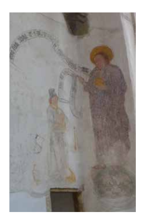
6. Salvator Mundi and a Donor, 1470, a fresco in the Saint Catherine's Chapel in Mitterarnsdorf

front of a decorated curtain (as the saints in the Flémalle Panels) [fig. 10].<sup>43</sup>