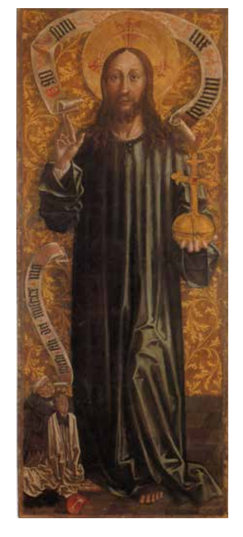
Salvator Mundi, Cathedral Museum in Cracow

The painting depicts full-figure Christ as Salvator Mundi ; its size is 232 by 93 cm and it was painted with tempera on canvas (!) without any chalk ground, only with bole ground and gold leaf in the area of Christ's halo. The painting comes from the Cracow Cathedral and is now kept in the Cathedral Museum in Cracow. It could have been a votive painting or an epitaph, as it includes a small figure of a kneeling donor: a canon with the Jasieńczyk coat of arms, with a banderole inscribed "O ihesu fili dei miserere mei". Christ holds a golden globe with a cross on its top in his left hand, and blesses with the right hand. He is dressed in a simple grey robe with long sleeves and he stands barefoot on the floor. There is a decorated cloth in the background and a banderole with an inscription "Ego sum lux mundi" around Christ's head. This extremely interesting painting has not been a subject of many publications. For a long time, it had been in a very bad condition and was not easily accessible for scholars, as, until 1979, it hung fairly aloft in