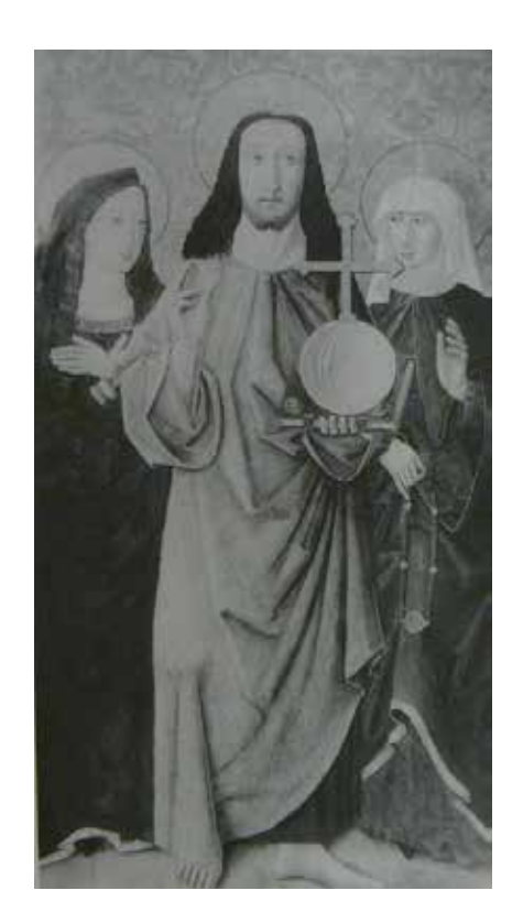
8. Salvator Mundi and Two Saints, ca. 1500, Cathedral in Frankfurt am Main

exposing the structure of the canvas. 50 Such paintings. created entirely on canvas, may have either served as 'painted clothes' or as regular paintings. Often, the latter would have been nailed to the wooden support, but they could always be easily detached and rolled up for transportation. It is commonly assumed that canvas painting was the Netherlandish idea; we know that there were images on linen produced there as early as before 1400; Flanders was a leading cloth-trade centre in Europe already in the fourteenth century.51 It is well known that the most famous Netherlandish painters (including Jan van Eyck, Rogier van der Weyden, Dirk Bouts, Hugo van der Goes, Joos van Ghent, or Gerard David) painted not only on panels, but also on canvases. 52 Of course, painted clothes were also produced in Central Europe. For example, according to the written sources, there was a painted curtain produced for the Our Lady church in Wrocław at the beginning of the fifteenth century, and in the Museum Kirche zum Hl. Kreuz in Zittau, there is a painted cloth known as the Zittauer Fastentuch, dating back to