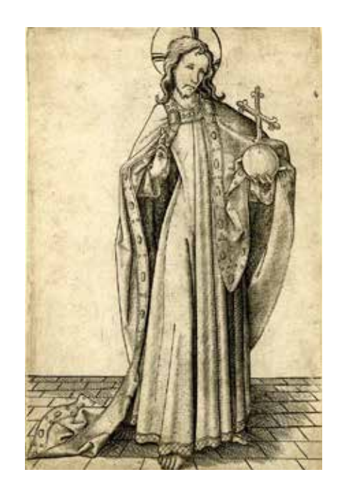
3. Master E.S., Salvator Mundi, L124

clothing: in some images he wears only a robe (usually grey or other neutral colour) but in others he wears a robe and a coat (and the set is often of vivid colours. e.g. red and blue). The version with a coat was probably more popular, as there are quite a few fifteenth century examples following it, especially among prints (e.g. L124 by Master E. S., ca. 146 [fig. 3];<sup>30</sup> L 45 by the Master of the Berlin Passion, ca. 1460;31 or the illustrations to the text Fasciculus temporum by Werner Rolevinck mentioned above). Also, there is a statue in the Chapel of Johann Hardenrath in the St. Mary's Capitol church in Cologne, created before 1466 in the workshop of Nikolaus Gerhaert van Leyden, which represents the same type.<sup>32</sup> Central-European painted examples, dating back to the end of the fifteenth century, are for instance: a panel in Staatsgalerie im Hohen Schloss in Füssen (Unknown Master from Augsburg, 1494) [fig. 4],33 and a painting from the Dominican monastery in Cracow (ca. 1500, kept in the National Museum in Toruń as a deposit from the National Museum in Warsaw).34 Salvator Mundi in a coat was the most common type also in the half-length