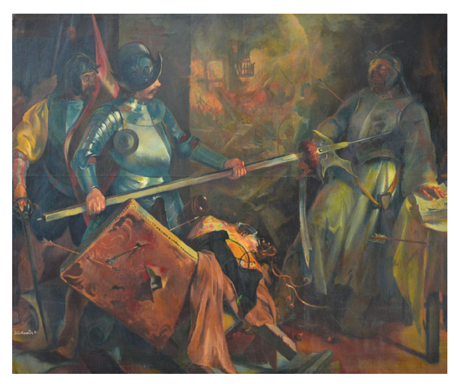
The death of György Fráter. Painted by Kálmán Istókovits (Castle Museum of Siklós)

awkwardly. In March 1552, he ordered the establishment of a body of four cardinals to investigate the case<sup>43</sup>. An often halting, detailed and complex examination process started, lasting until 1554. The case rested upon the articles collected by the lawyers of Ferdinand and the Pope, the main purpose of which was to prove the monk's betrayal or innocence by throwing light on the legitimacy of the murder<sup>44</sup>.