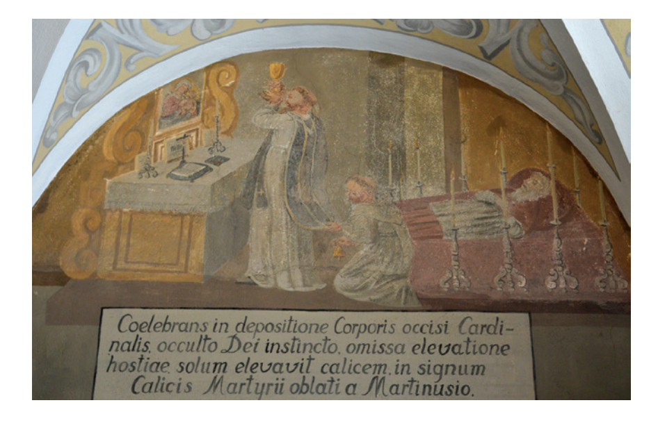
6. György Fráter on his funeral bier. The painting can be found in the porch of the monastery of Częstochowa (17<sup>th</sup> century)

Fráter's independence and obstinacy generated further problems, as he also opposed the will of Ferdinand I. This is proven by the testimony of Miklós Oláh, the bishop of Eger and the later archbishop of Esztergom, who also gave voice to his experience: once he heard in the royal council that Fráter did not write to the sultan and the pasha what had been instructed by the king, but what he wanted<sup>31</sup>. There is a good example of this: in late 1551, Ferdinand I wanted to continue the anti-Ottoman battles, but Fráter, defying the orders of the king, sent the diminished and exhausted Transylvanian army home.