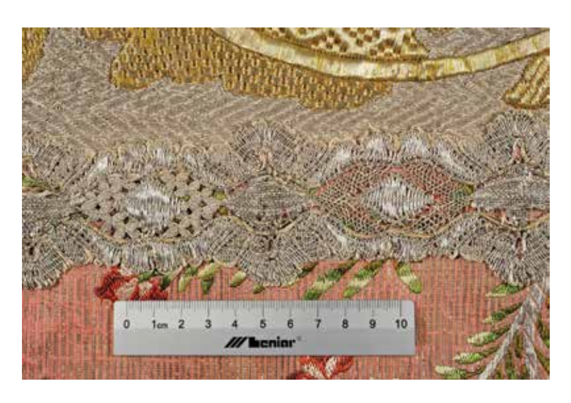
1. A piece of metal bobbin lace adorning the chasuble from the collections of Benedictine Convent in Staniątki, second half 19^{\rm th} century