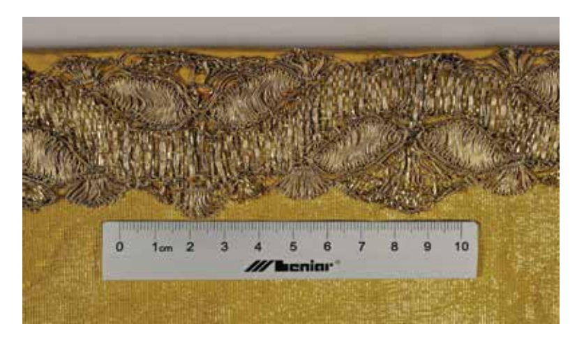
2. A piece of metal bobbin lace adorning the chasuble from the collections of Benedictine Convent in Staniątki, 18^{\rm th}/19^{\rm th} century