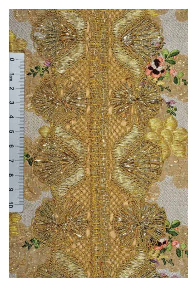
3. A piece of metal bobbin lace adorning the chasuble from the collections of Benedictine Convent in Staniątki, early 20^{\rm th} century