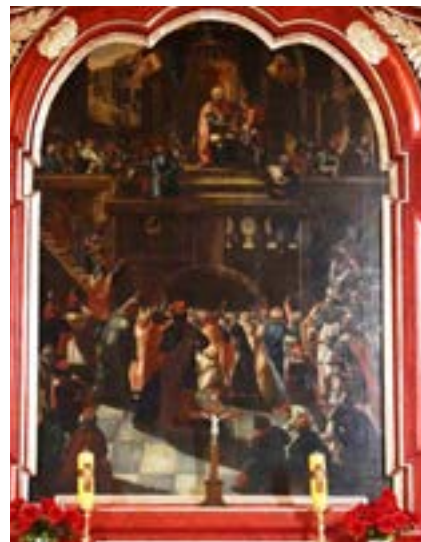
7. Pilate's Hall in the Calvary.