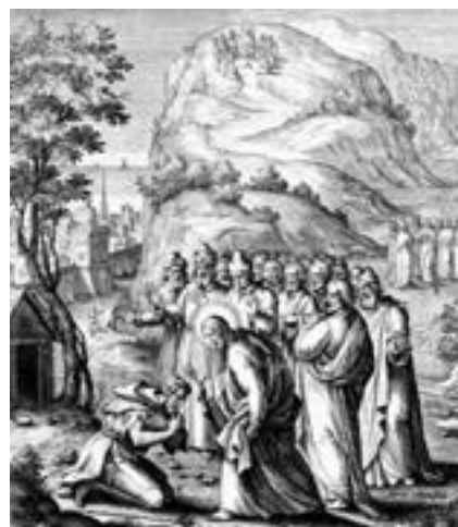
5. Engraving 26, https://archive.org/details/adnotationesetmeoonada/mode/2up (19.05.2021)