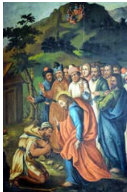
4. The scene with a deaf mute man healed, https://archive.org/details/adnotationesetmeoonada/mode/2up (19.05.2021)