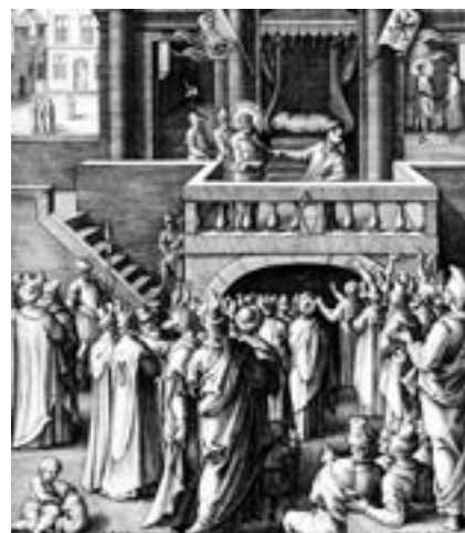
8. Engraving 123, https://archive.org/details/adnotationesetmeoonada/mode/2up