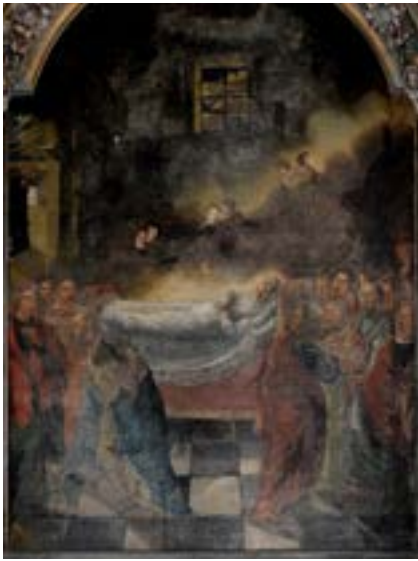
6. The Funeral of Virgin Mary, the Chapel of the Adoration of Mary's Soul.