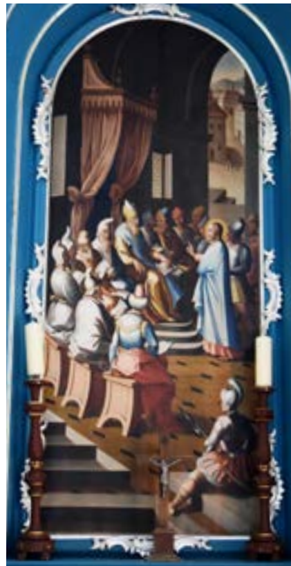
11. Altar paintings in the Chapel of the House of Caiaphas.