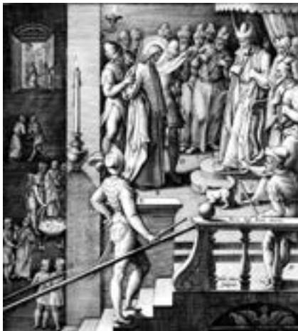
10. Engraving 114, https://archive.org/details/adnotationesetme00nada/mode/2up

cycle serve both as a commentary addressed to illiterate common village folk and a more sophisticated audience: an example of which is the wise man looking through a magnifying glass in the Trial Before Pilate . The presence of the sage wishing to study faith through science and reason suggests that the painting is an evidence of the dispute with the Classicist thinkers, all the more because the wise man does not appear in any of the Antwerpian engravings. Moreover, the paintings were placed in altars chronologically and according to specific narrative criteria, e.g. the main matrix in the Chapel of Gethsemane contains the scene of the Awakening of the Apostles , with a sign reading "Simon dormis" above, and the upper image matrix a scene in which the cohort arrives in Gethsemane; in the next chapel (Capture) we turn our eyes first towards the picture on the upper level ( Soldiers Prostrate Before Christ in Gethsemane ), and then towards the main matrix with the scene of the capture and Judas's betrayal. We notice that the paintings were clearly arranged in a sequence, which appeared to the pilgrim as a scenery with illustrated commentary to the routes and a signpost, since the arrangement of the figures and complete visual compositions followed the pilgrim's direction of movement.