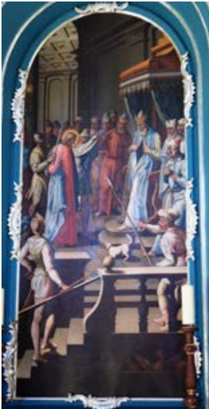
12. Altar paintings in the Chapel of the House of Caiaphas.