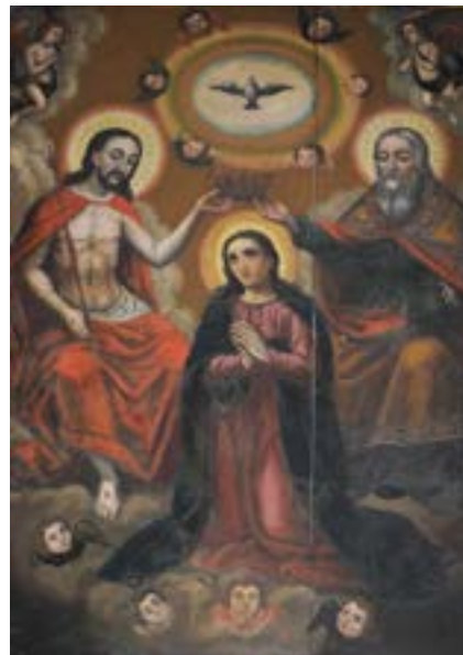
2. Coronation of Virgin Mary, ca. 1639, cloisters.