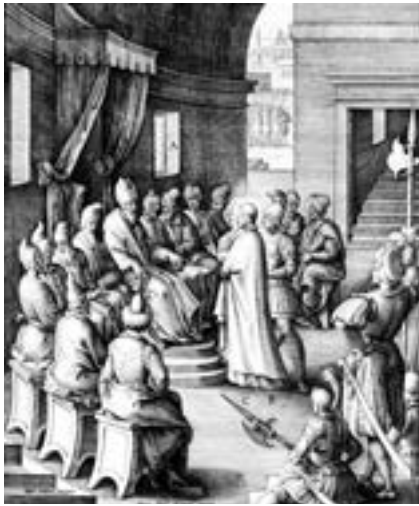
9. Engraving 116, https://archive.org/details/adnotationesetme00nada/mode/2up