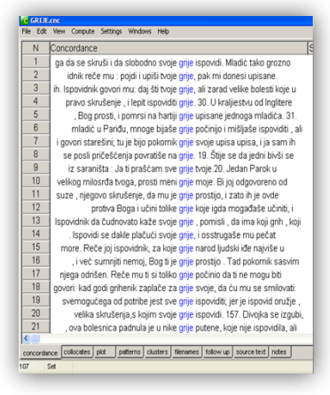
Figure 8 : Concordance lines for word "grije"

and purification, go through Purgatory onto heaven, souls' stay in Purgatory, the pains of Hell, eternal Hell torments; lessen, see, undergo, suffer, contemplate, condemn (to) Purgatorial torments, etc.).